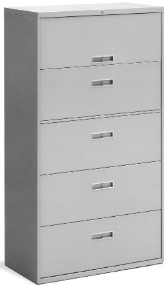
800 Series Lateral File