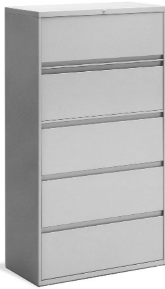
900 Series Lateral File