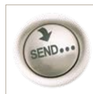
One-Click-Publishing note capture and distribution