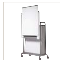
Huddleboards on a mobile easel