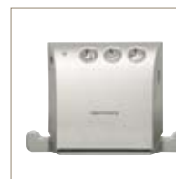
Left side bridge for CopyCam Pro