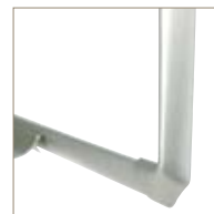
Mistic Metal Premium Whiteboard