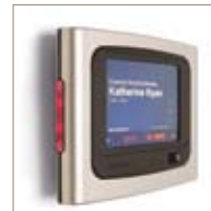
RoomWizard Room Scheduling System

Lightweight, portable, and versatile, Huddleboard is a portable whiteboard solution that can be easily placed under the CopyCam for image capture then moved away for use elsewhere. Huddleboard, when used with CopyCam, provides flexible and multiple solutions for your working or learning environment.