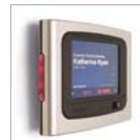
Lights indicate room usage or availability