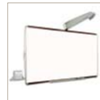
CopyCam and Mystic™ Premium Whiteboard

Schedule meetings via the web-based reservation system or your corporate calendaring system. RoomWizard synchronizes with many server-based calendaring systems, allowing users to continue using their existing system. The following features are available in each mode of operation: