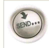
One-Click-Publishing note capture and distribution