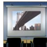
Echo Projection Screen