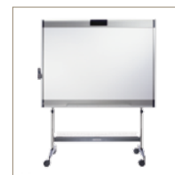
Walk-and-Talk Interactive Whiteboard with Adjustable Height Stand