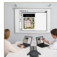
Echo Projection Screen