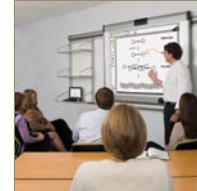
THUNDER Express with Walk-and-Talk Interactive Whiteboard

The sleek European styling of the Echo Projection Screen brings THUNDER Express alive, providing superior quality projected images clearly visible to all in the room.