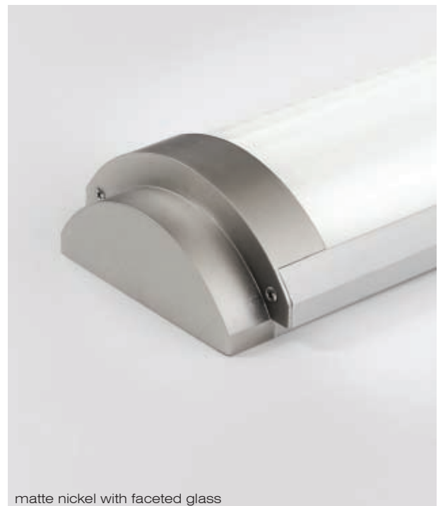
matte nickel with faceted glass