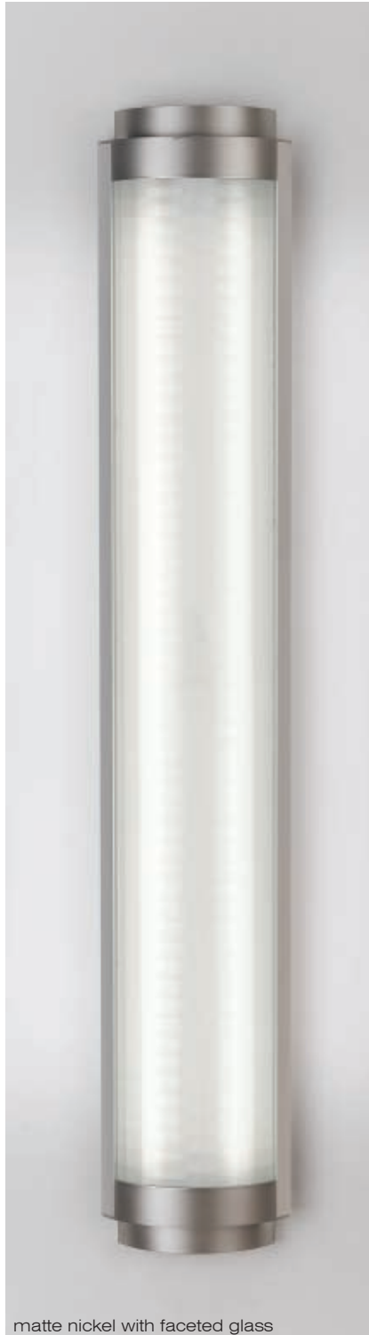
matte nickel with faceted glass