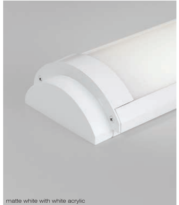
matte white with white acrylic