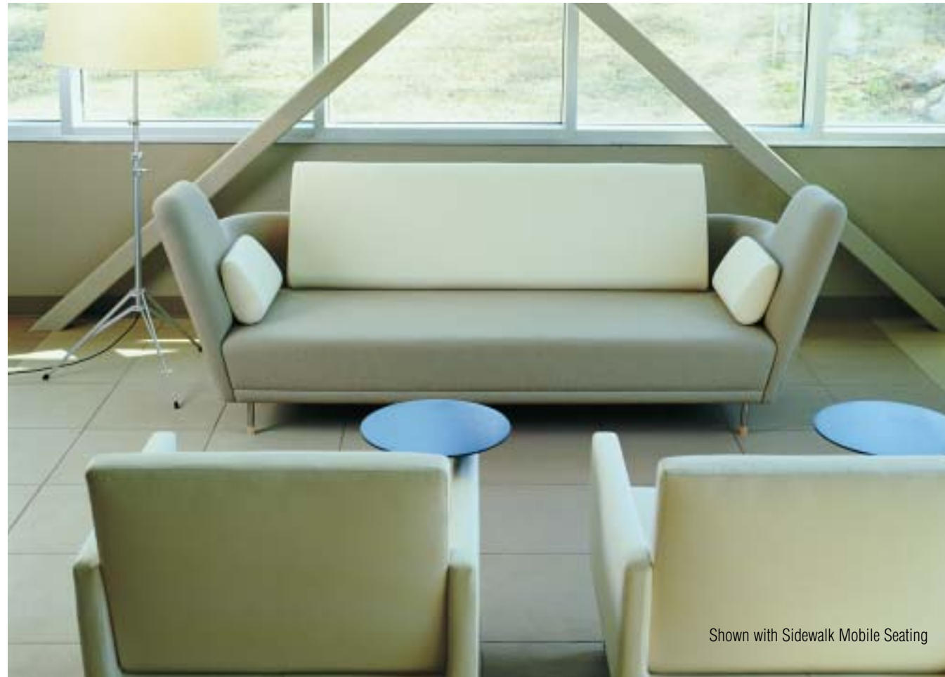
Shown with Sidewalk Mobile Seating