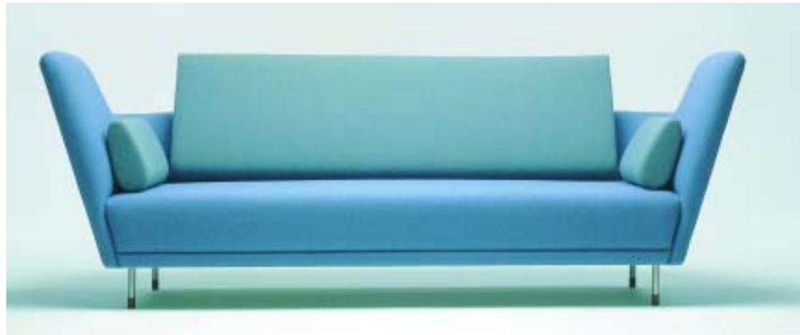
FJ57 Sofa: Contrasting fabric option. Clear lacquered maple finish standard.