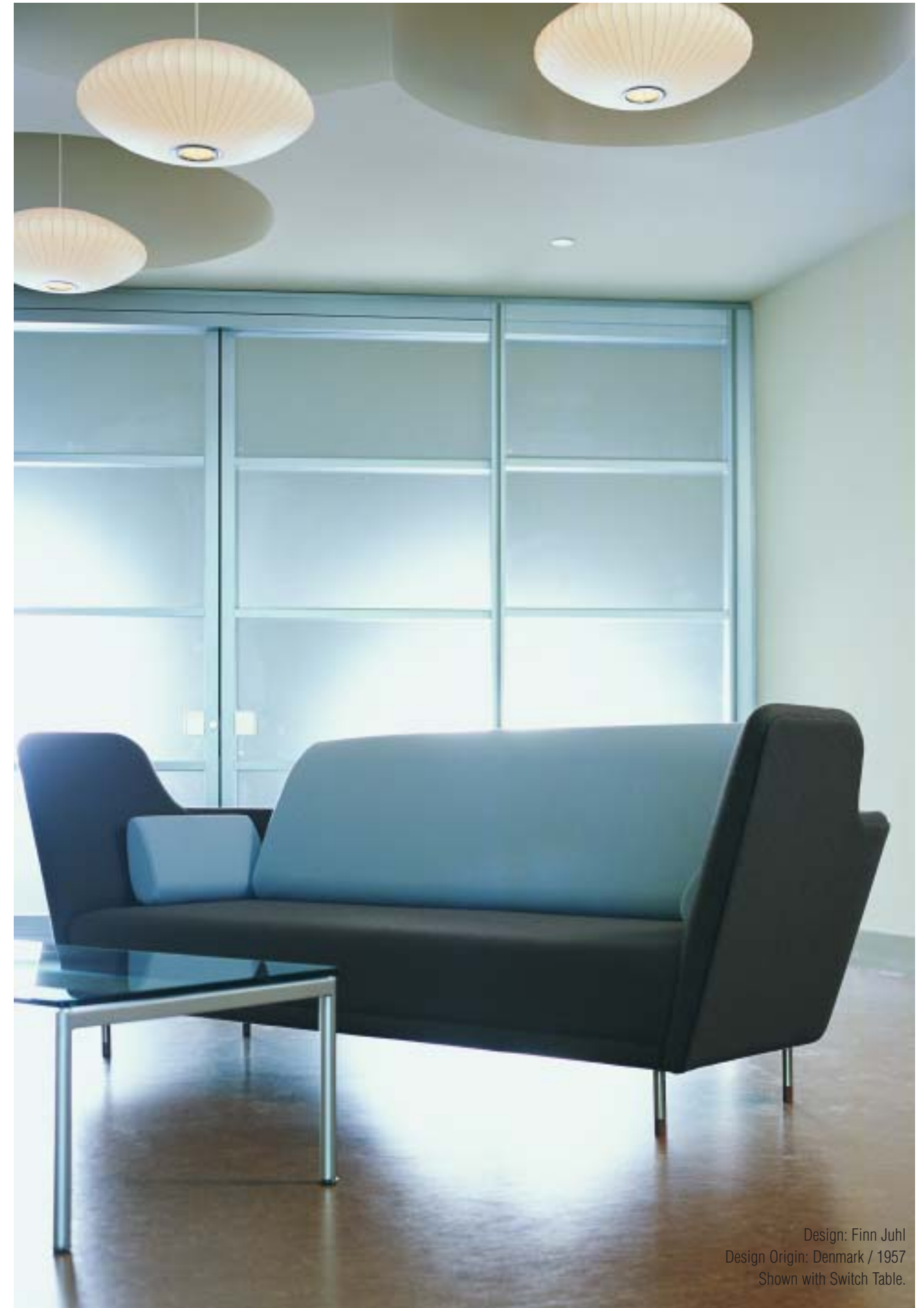
Design: Finn Juhl Design Origin: Denmark / 1957 Shown with Switch Table.

Finn Juhl, along with Hans Wegner, Arne Jacobsen, Poul Kjærholm, Børge Mogensen, Poul Henningsen and Verner Panton made Danish Design world famous. Finn Juhl's work was controversial for his time. His ideas pushed the limits of traditional Danish Design and gave it a renewed energy. Brayton International can now provide these renowned designs to our customers through our partnership with Hansen and Sørensen of Denmark. The 57 Sofa is available in COM/COL and our graded-in leathers and textiles. Standard lead times apply.