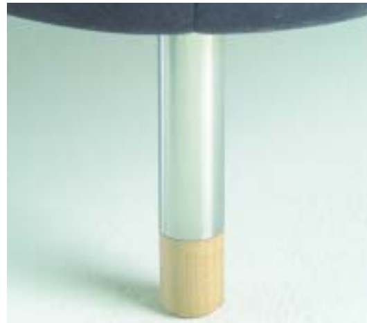
Stainless steel leg with wood foot. Clear lacquered maple finish standard.