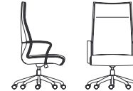
798-P Highback / Large Scale Pillow Upholstery

Overall Dimensions: 26D 26.5W 45H Inside: 19.5D 21W 29.5H Seat: 19H - 22H Arm: 25.5H