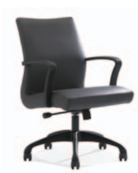
795 Conference Chair