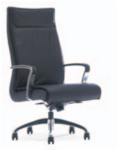
798-P Highback Chair / Pillow Upholstery / Large Scale Optional Polished Aluminum Arms and Base