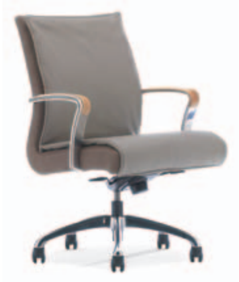
796-P Midback Chair / Pillow Upholstery Optional Polished Aluminum Arms with Wood Caps Polished Aluminum Base