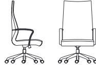
798 Highback Chair / Large Scale

Overall Dimensions: 26D 26.5W 45H Inside: 19.5D 21W 29.5H Seat: 18.5H - 21.5H Arm: 25.5H