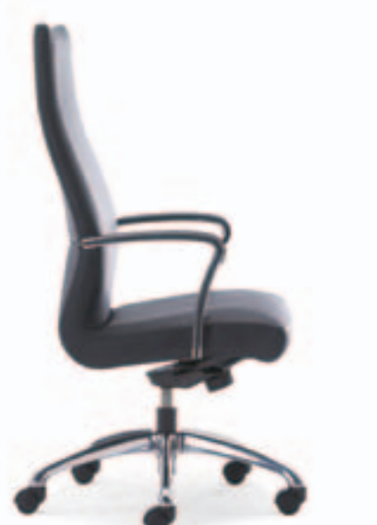
798 Highback Chair / Large Scale Optional Polished Aluminum Arms and Base