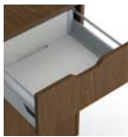
Self-closing drawers reduce noise, better fit and feel