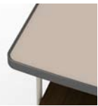
Rounded corners for user safety and aesthetic appeal