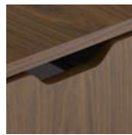
Imbedded drawer pulls for ease of use and maintenance