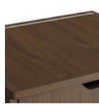
Strip on back of top surfaces to contain items, liquid