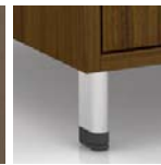
Glide can be adjusted to accommodate uneven floors