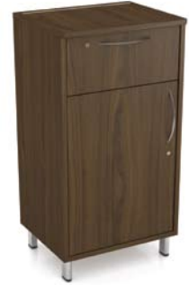
Bedside Cabinet 38" high with drawer, door, inside shelf, pulls and locks, and metal legs REVV-00106 W 20 H 38 D 16.5