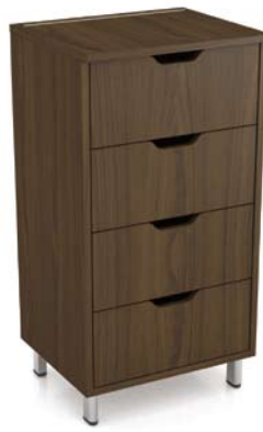
Bedside Cabinet 38" high with four drawers and metal legs REVV-00104 W 20 H 38 D 16.5