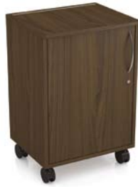
Bedside Cabinet 30" high with door, inside shelf, pull and lock, and locking casters REVV-00103 W 20 H 30 D 16.5