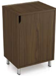
Bedside Cabinet 30" high with door and metal legs, includes an inside shelf REVV-00102 W 20 H 30 D 16.5