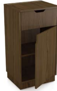
Bedside Cabinet 38" with drawer, door, inside shelf, and plinth base REVV-00105 W 20 H 38 D 16.5