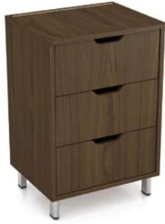
Bedside Cabinet 30" high with three drawers and metal legs REVV-00101 W 20 H 30 D 16.5