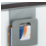
Magazine holder or newspaper storage