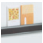
Integrated track for greeting card display