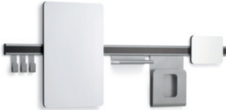
Display System RVR/96-PKG-1 Package includes: three hooks, large marker board, shelf, magazine holder, small marker board