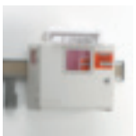
Universal bracket allows customization