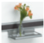
Fixed shelf for flower or picture frame display