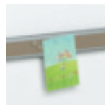
Self-healing tackable strip