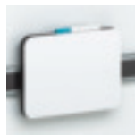
Dry erase pen storage