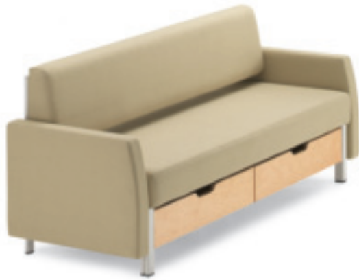
Single Size, Arcked Arm RVS31/80 W 80 H 33 D 28