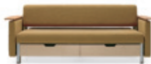
Twin Size, Thick Arms Opt Tablet Arm Caps RVS35/80-TA W 87 H 33 D 34/46