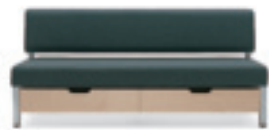
Single Size, Armless RVS10/72 W 72 H 33 D 28/34