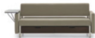
Twin Size, Thick Arms Opt Side Table RVS35/80-ST-L W 92 H 35 D 34/46