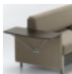
Side table allows seamless integration of horizontal surface