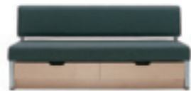
Single Size, Armless Opt Floor Panel RVS10/72-IF W 72 H 33 D 28/34