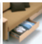
Integrated drawers provide storage for guests and facility