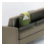
Rear storage provides dedicated space for personal items (twin only)