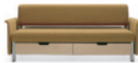
Twin Size, Thin Arms RVS25/80 W 80 H 33 D 34/46