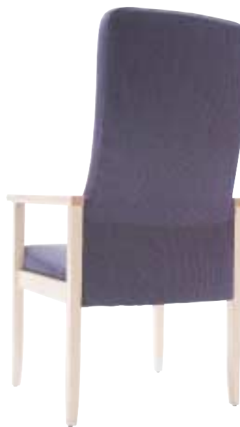
H227 Highback Patient Chair Standard Wood Pommel Grip Arms