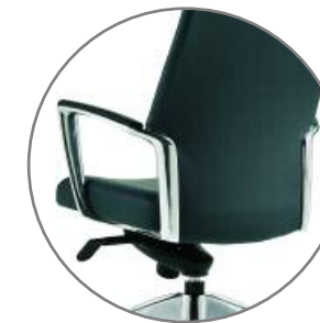
Lumbar area provides additional support.