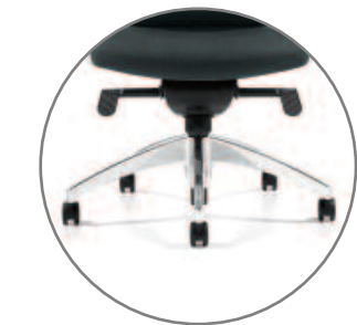
Standard polished cast aluminum base. Black base optional.