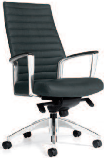
2670-2 - High Back Knee-Tilter Shown in Softhide Smoke (S046)