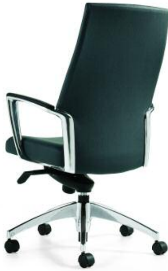
2670-2 - High Back Knee-Tilter Shown in Softhide Smoke (S046)