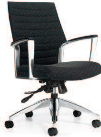
2671-4 - Medium Back Tilter Shown in Garrison GA07 Charcoal