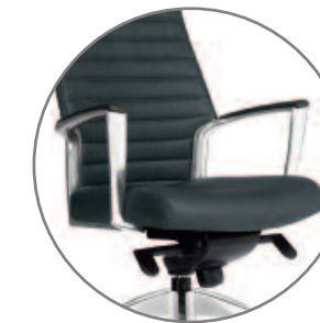
Polished aluminum arms with soft, warm armrests.