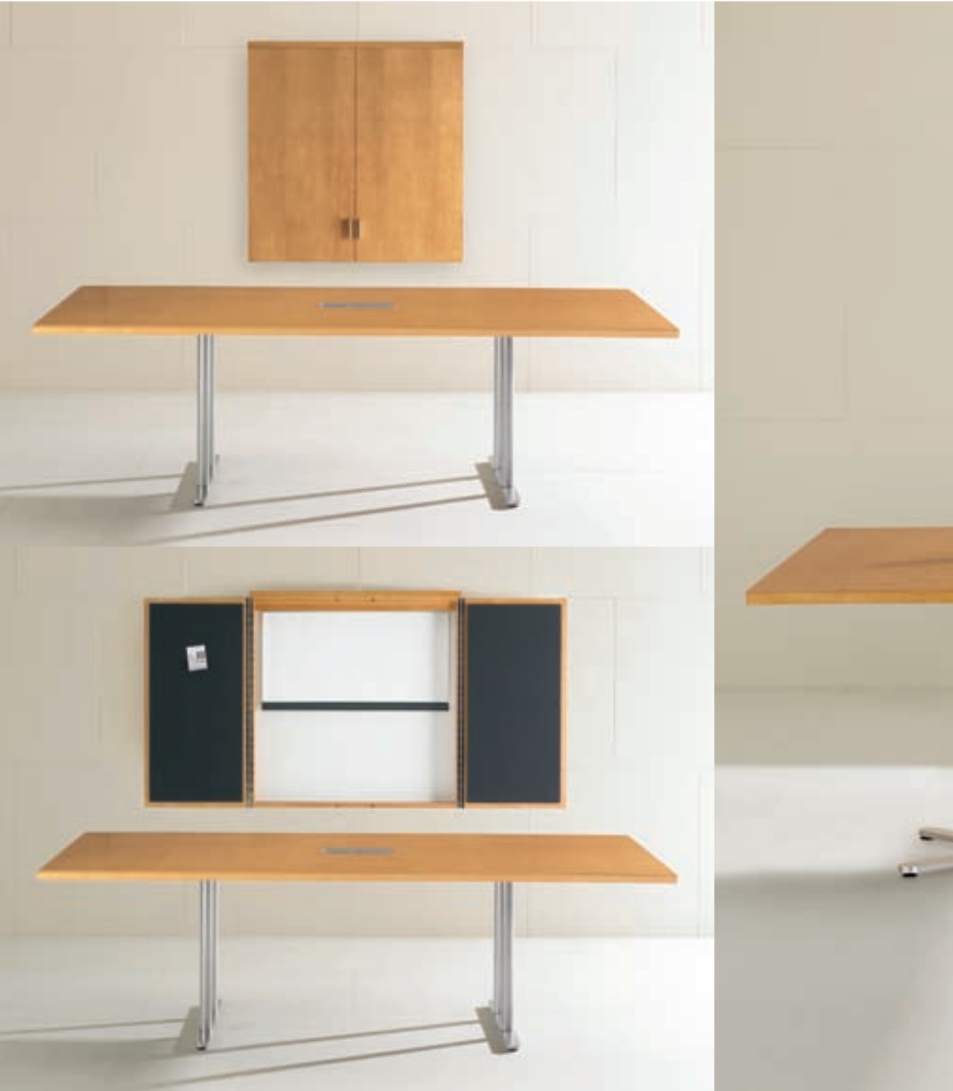
01 Ashton 960W x 480D conference table with metal I-bases to incorporate wire management for power/data access. Wall mounted presentation cabinets increase the functionality of any conference area.