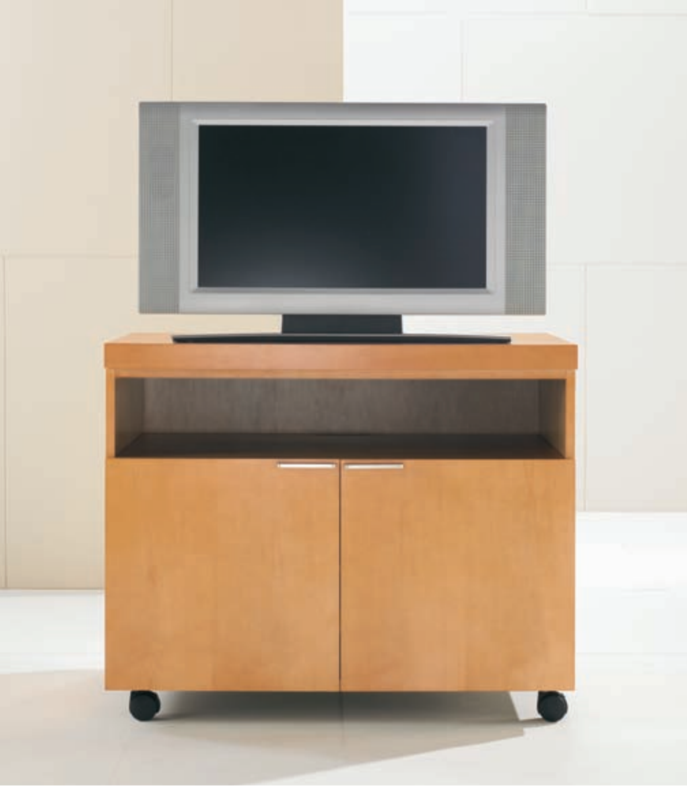
06 Mobile cabinetry addresses the versatile functionality required for group work environments. The audio/video cart features open and closed storage capabilities and is available with power/data communication access.