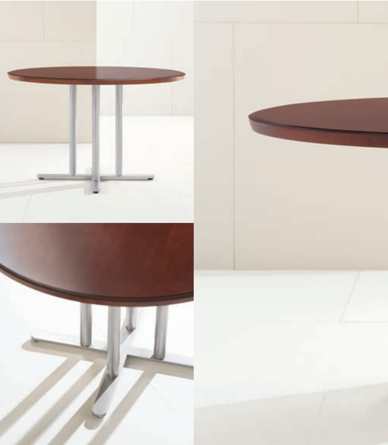
07 Metal X-bases and I-bases incorporate wire management channels and are standard in HBF Satin Pewter powder coat finish.