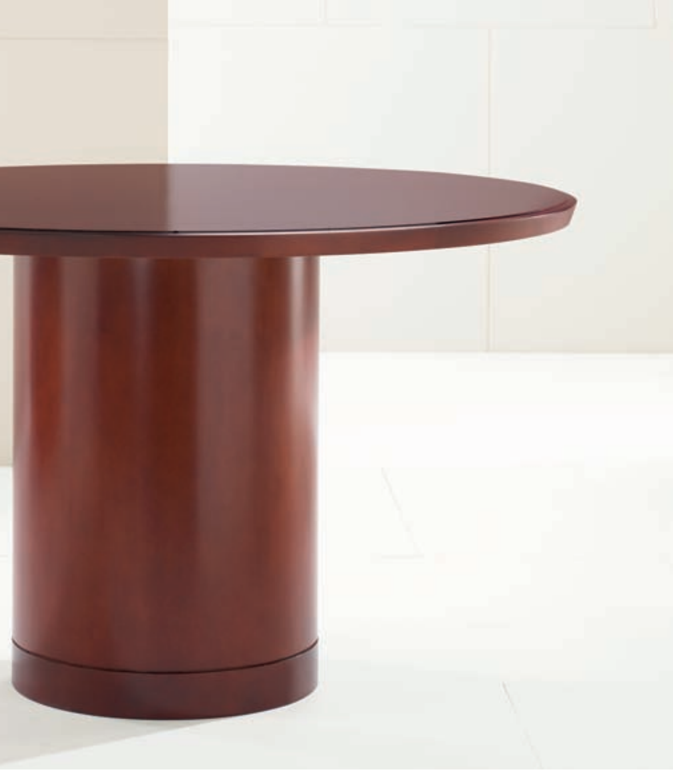
08 Ashron, Mercer and Fairmont tables are also offered with wood base options. All tables are available with and without power/data access. This 48" diameter Ashton table is finished in HBF 06 Amber Cherry on maple.