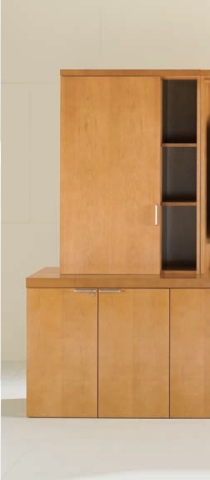
03 Lecterns, with a choice of three edge details, provide a functional addition to enhance the versatility of the more formal conferencing area. Open shelves and enclosed cabinetry provide storage for presentation materials.