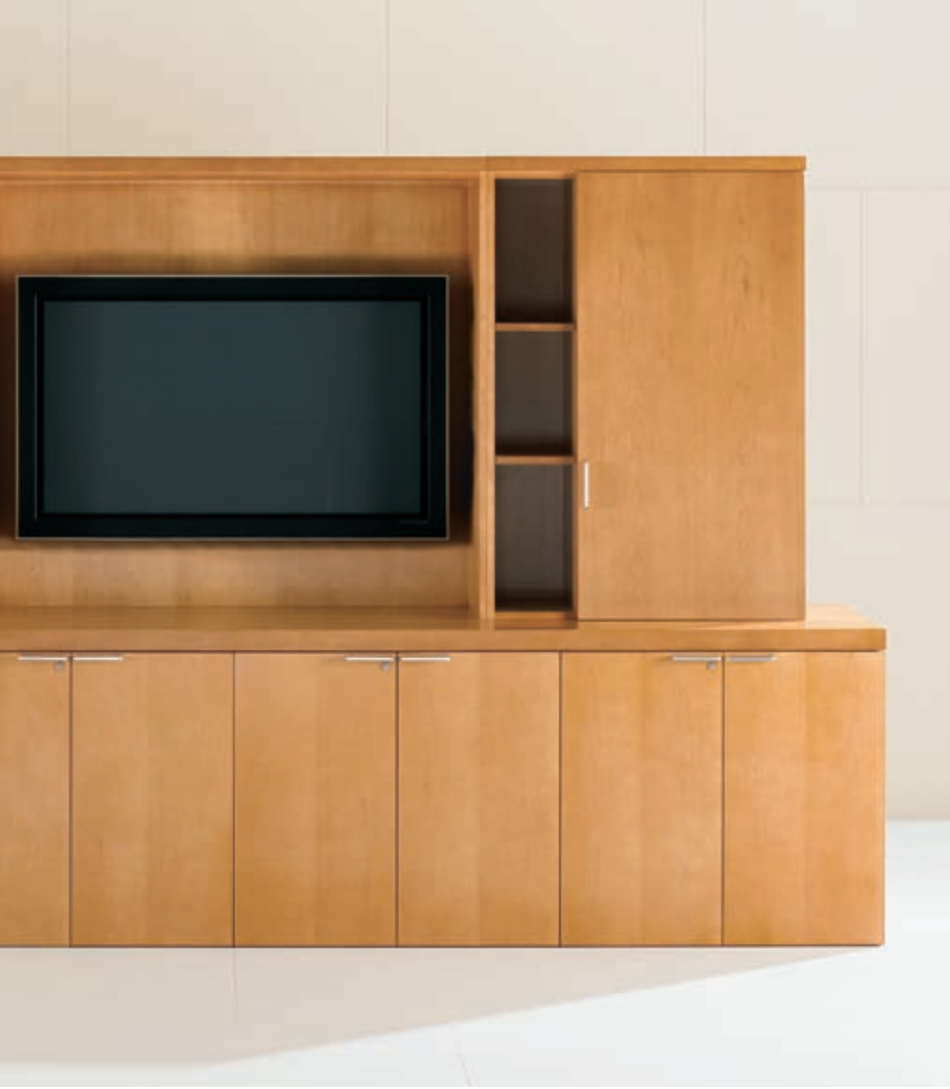
04 The Ashton | Mercer | Fairmont Conference Series features a comprehensive offering of conferencing cabinetry that provides flexible components to address the requirements of today's meeting and conference environments.