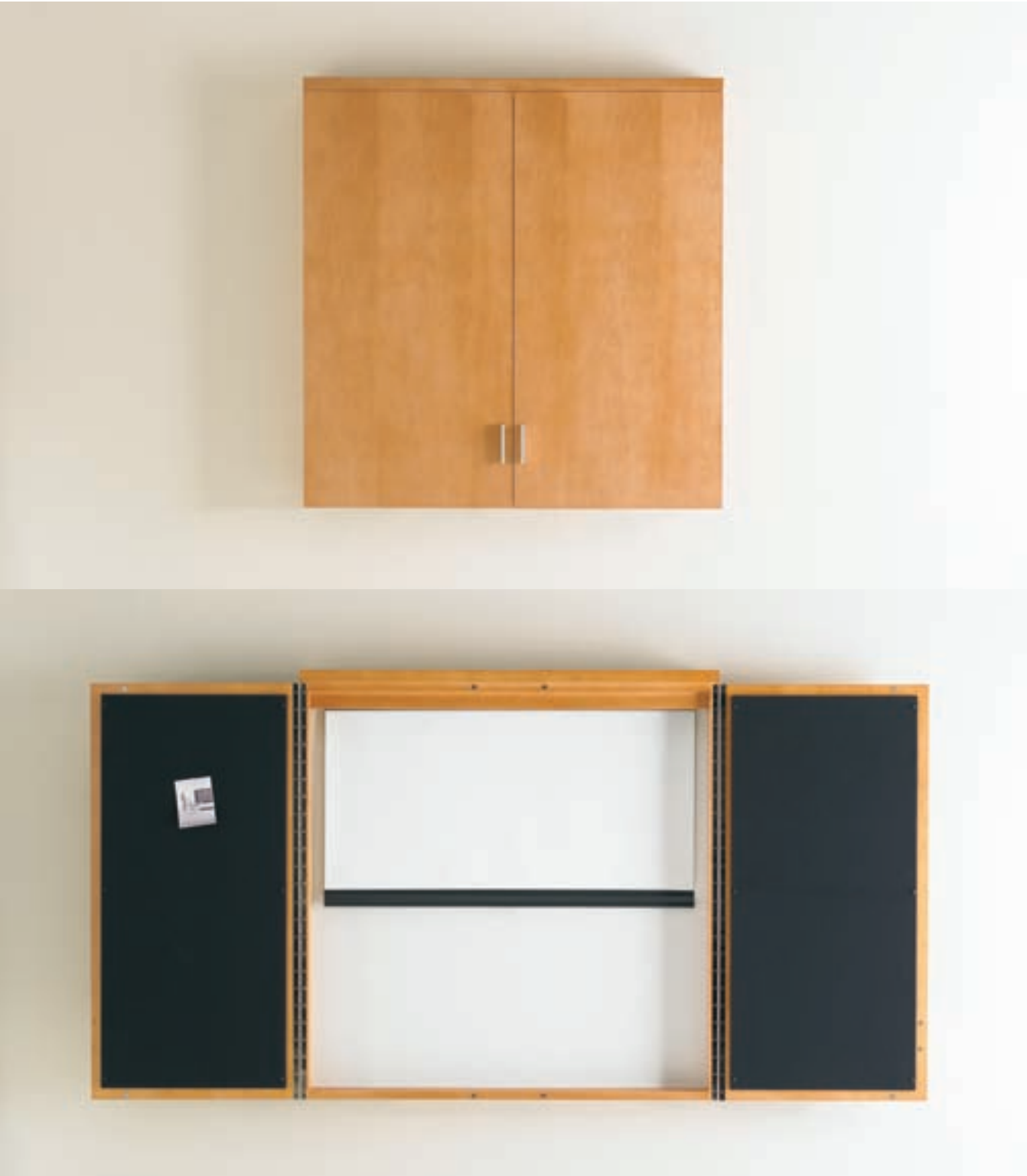
05 Wall mounted presentation cabinets with optional crown moulding feature hinged wood doors, white marker board, pull down projection screen and fabric covered tackable surfaces on the inside of each door.