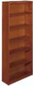
84x36 4 adjustable shelves