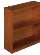
36x36 1 adjustable shelf