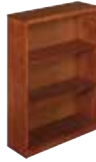
48x36 2 adjustable shelves