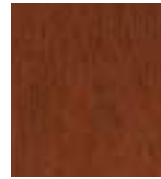
Amber on Cherry