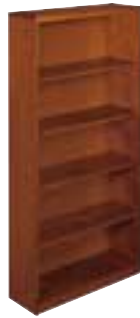
72x36 3 adjustable shelves