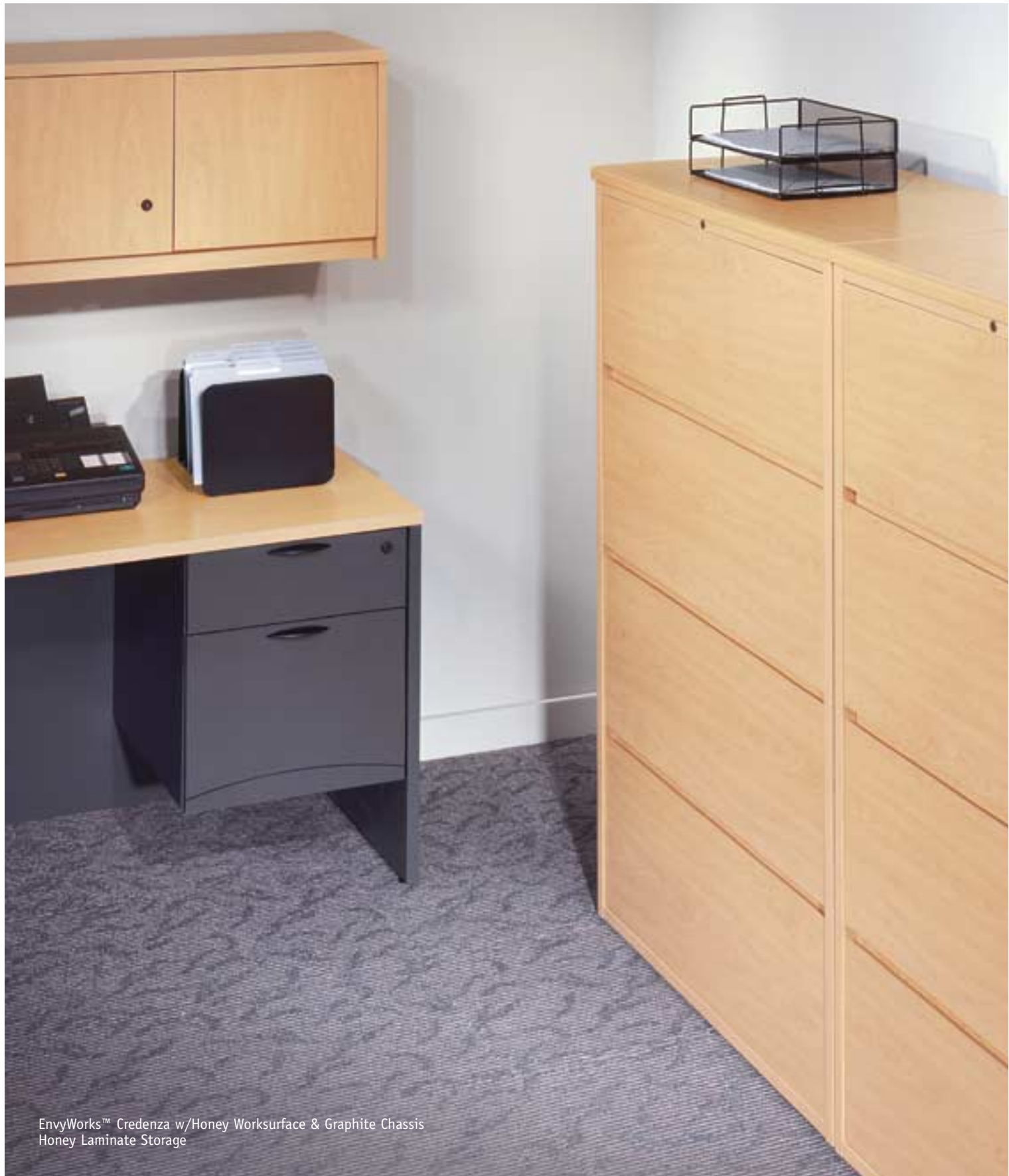
EnvyWorks™ Credenza w/Honey Worksurface & Graphite Chassis Honey Laminate Storage

Your office speaks volumes about you. National bookcases and lateral files are the perfect means to keep your important resources at hand (especially those ever-necessary software manuals). Choose fully-assembled veneer or ready-to-assemble laminate bookcases. Although the lines are slender and graceful, those adjustable shelves are sturdy enough each to handle a hundred pounds. And our four-drawer universal lateral file, with smooth-as-silk slides and laminate back, lets you organize document storage solutions front-to-back or side-to-side. They say knowledge is power. You're looking strong, indeed.