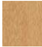
Honey on Maple