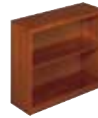
30x36 1 adjustable shelf