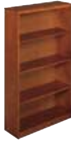
60x36 2 adjustable shelves