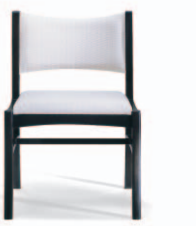
309-91, Side Chair