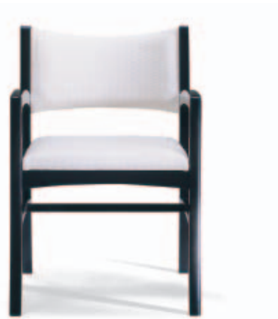
309-92, Arm Chair