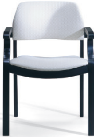
305-92, Arm Chair