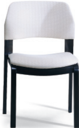
305-91, Side Chair