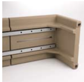
Tubular steel frames connect individual sections.