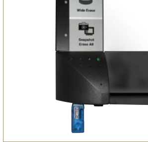
Bluetooth Module Installed on TS Series Interactive Whiteboard