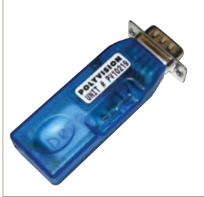
Bluetooth Module for TS Series Interactive Whiteboard