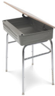
CLASSIC LIFT LID DESK MODEL NUMBER LW45645