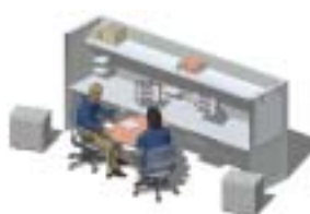
Working with another.