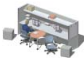
Working as one.

Of course, FYI (as the name implies) is for your information. It delivers the support that workers in a team of 2 or 10 require where sharing information is today's rule of thumb. FYI enables it.