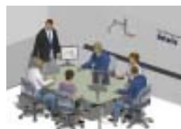
Working as a group.