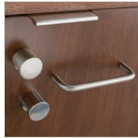
Optional pulls, knobs, or handles in nickel or polished chrome