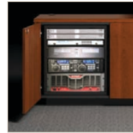
Media rack fits in 72"L credenza.