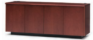
ABOVE: EXPONENTS [CHERRY VENEER].