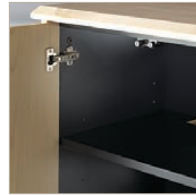
Doors have 90°, three-way adjustable, European-style hinges.