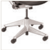
Kart four-star nesting base