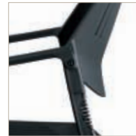
Kart Stack flex-back