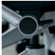
Kart height adjustment lever