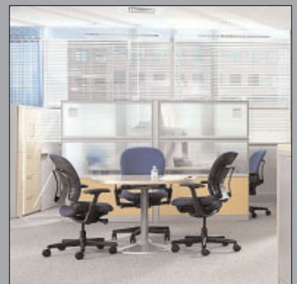
Wood furniture was produced at the Steelcase Wood Plant in Caledonia, Mich., the world's first LEED-certified manufacturing facility.